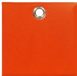
Orange Storage Box