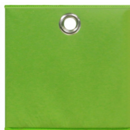
Green Storage Box