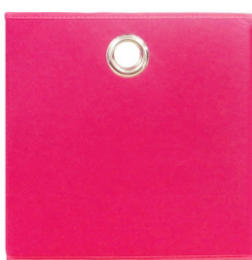
Pink Storage Box