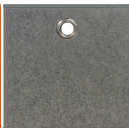
Grey Storage Box